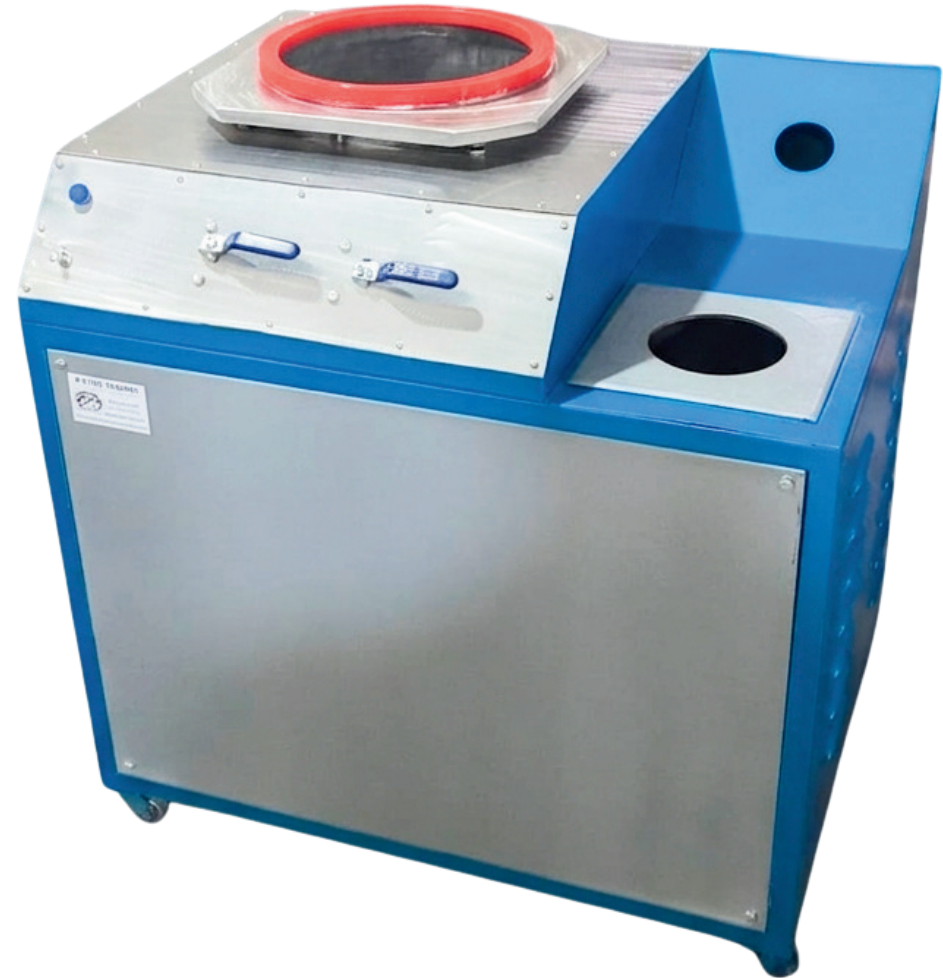
Industrial Vacuum Chamber Machine