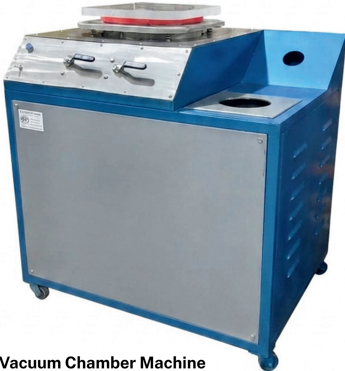
Industrial Vacuum Chamber Machine